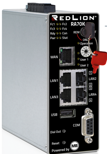
RA70K Keyed Remote Access Router

Ensure your devices are always up to date with the latest firmware and patches.